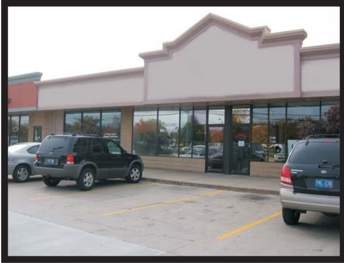
2012-2336 S. Mission Street

Stadium Mall is an established 57,000 square foot retail development adjacent to CMU's football stadium and across the street from the Mt. Pleasant Shopping Center that houses BIG K and JCPenney. Target, ABC Warehouse, Kohls, Sam's Club and Super WalMart are within 1/2 mile.