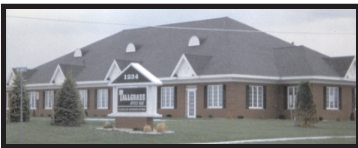
1230 & 1234 E. BROOMFIELD ROAD

Tallgrass Office Park is close to major traffic generators, such as Central Michigan University, Target, Super Walmart, Kohls, Sam's Club, and Menards.